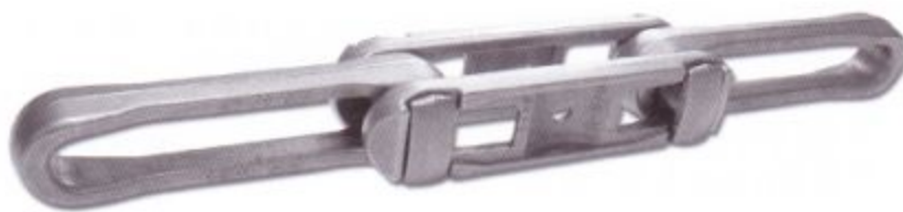
NZ. DU Type