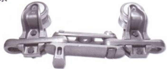
with henger and pushen dog